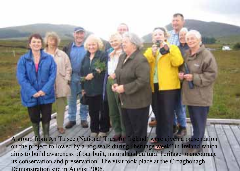
A group from An Taisce (National Trust for Ireland) were given a presentation on the project followed by a bog walk during “heritage week” in Ireland which aims to build awareness of our built, natural and cultural heritage to encourage its conservation and preservation. The visit took place at the Croaghonagh Demonstration site in August 2006.