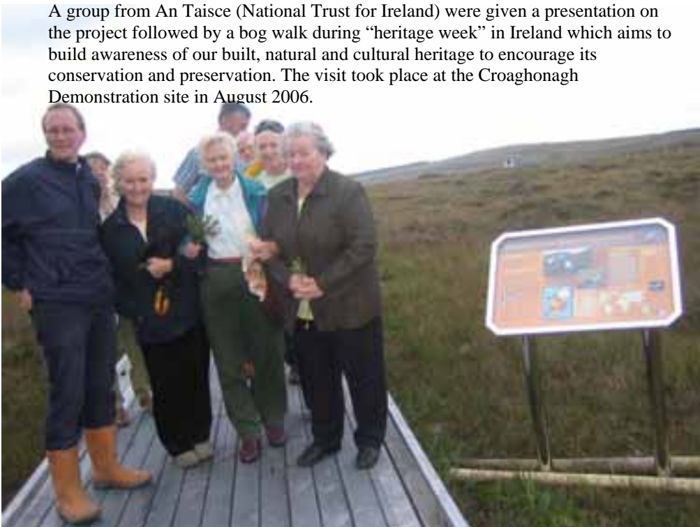
A group from An Taisce (National Trust for Ireland) were given a presentation on the project followed by a bog walk during “heritage week” in Ireland which aims to build awareness of our built, natural and cultural heritage to encourage its conservation and preservation. The visit took place at the Croaghonagh Demonstration site in August 2006.