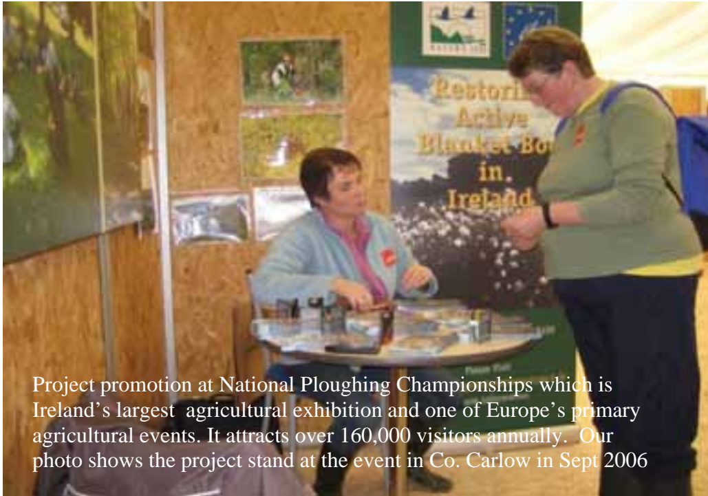
Project promotion at National Ploughing Championships which is Ireland's largest agricultural exhibition and one of Europe's primary agricultural events. It attracts over 160,000 visitors annually. Our photo shows the project stand at the event in Co. Carlow in Sept 2006